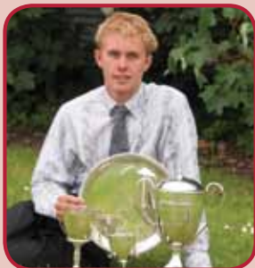
Ashley des Landes Taratahi Cup for Best Overall Wairarapa Student

Well done Class of 2011! Taratahi wishes you all the best with your future endeavours.