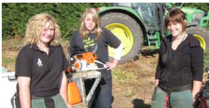
Taranaki students chainsaw training.