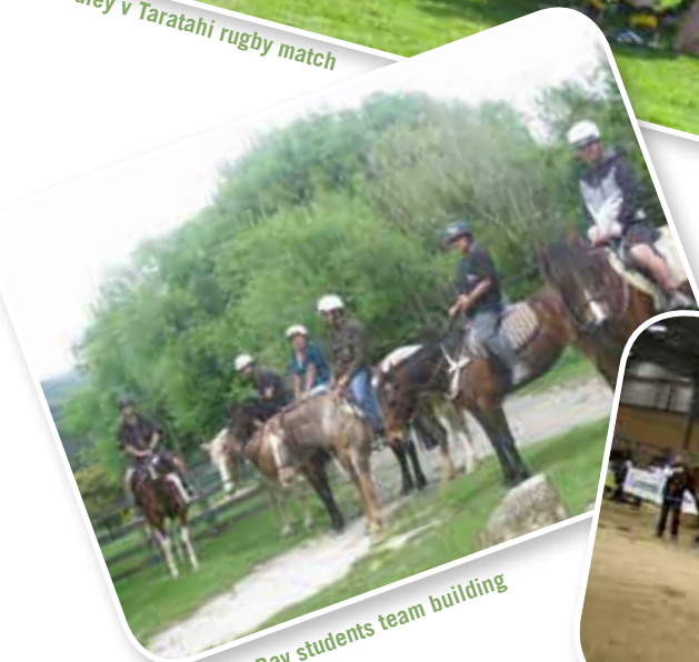
Hawke's Bay students team building