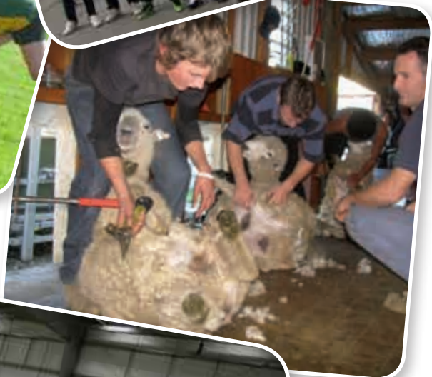
Hawke's Bay students learning to crutch