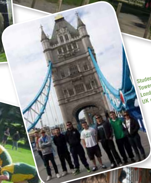
Students on the Tower Bridge in London, on their UK exchange