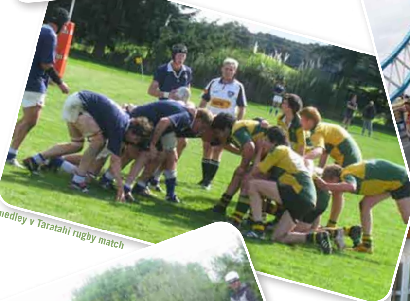
Smedley v Taratahi rugby match