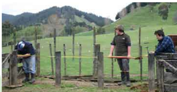
The finer points of fencing, Taranaki campus.